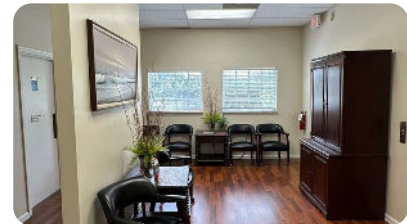
PROFESSIONAL ADDRESS/ ENHANCED SEARCH ANALYTICS