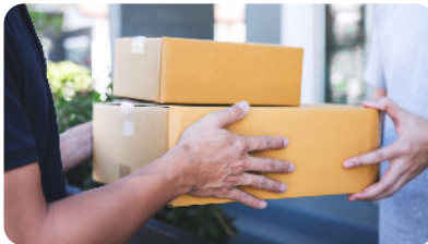
MAIL & PACKAGE RECEIPT