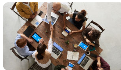
FLEXIBLE OFFICE & MEETING SPACE