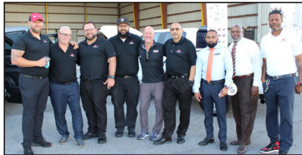
Special thanks to the Sky's The Limit Auction & Business After Hours Presenting Sponsor Treasure Coast Toyota of Stuart.