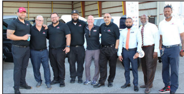
Special thanks to the Sky's The Limit Auction & Business After Hours Presenting Sponsor Treasure Coast Toyota of Stuart.