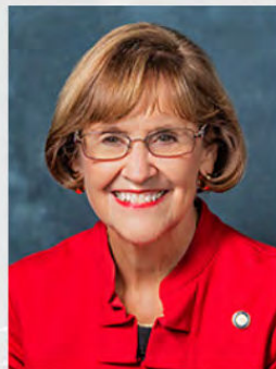
GAYE HARRELL Florida State Senator District 25