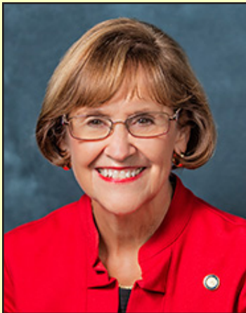
Gayle Harrell FL State Senator District 25