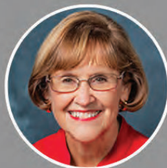
GAYLE HARRELL Florida State Senator District 25