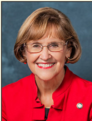
Gayle Harrell FL State Senator District 25