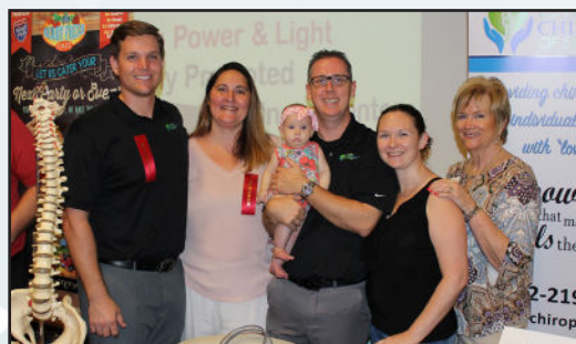
Loving Chiropractic of Stuart