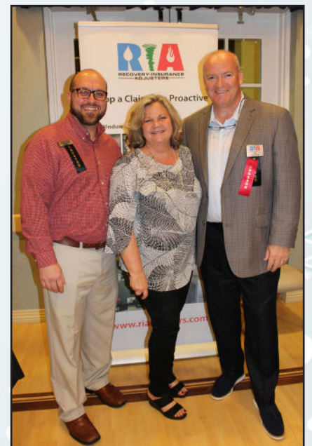
Recovery Insurance Adjusters

For more photos visit the Chamber's Photo Gallery at www.stuartmartinchamber.org