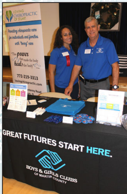
Boys & Girls Clubs of Martin County, Inc.

Investment Planning Group John Maxwell Team/Program Coordinator Loving Chiropractic of Stuart Martin Funeral Home & Crematory Martin Memorials Painting With A Twist PrimeLending Rainbow Intl./Restoration/Cleaning Sam's Club Senegence/Lipsense Sit & Stay Pet Care Skin Serenity Spa Sleep Number Slim Body Laser Spa, LLC. SMALLCAKES/Stuart SpeedPro Imaging The Fur Seasons Treasure Coast Square Mall Treatment Management Company Tykes & Teens, Inc. White Glove Moving & Storage Young Professionals of Martin County