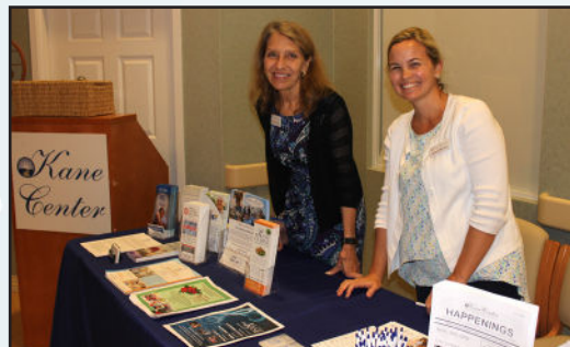
The Kane Center