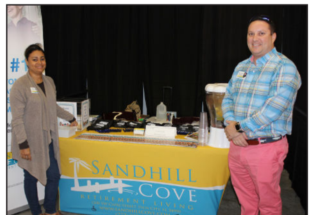
Special thanks to Sandhill Cove Retirement Living for sponsoring the Home & Garden Show. Sandhill Cove has been a major sponsor for more than ten years, providing a wealth of senior living information to the public.