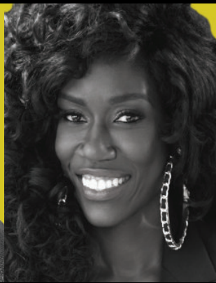
Bozoma Saint John