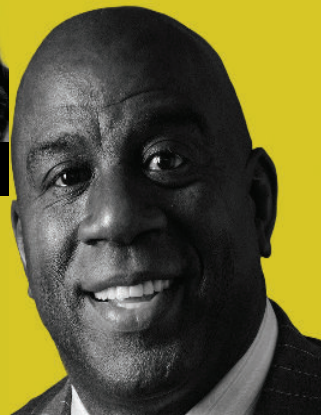
Earvin "Magic" Johnson