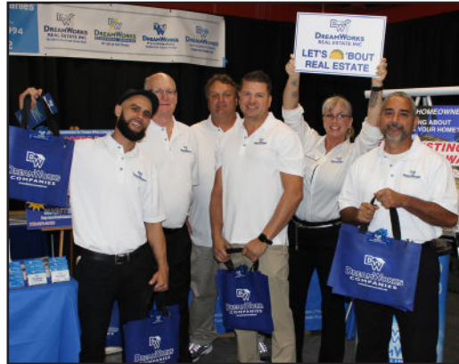
The gang's all here! As sponsor of the Chamber's Home & Garden Show, held March 7-8 at the Martin County Fairgrounds, DreamWorks Companies & Real Estate showed their teamwork as they presented the multitude of home services they provide.