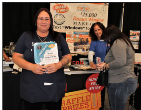
Storm Tight Windows, sponsor of the Home & Garden Show, offered exciting raffle prizes, including a $25,000 dream window makeover.